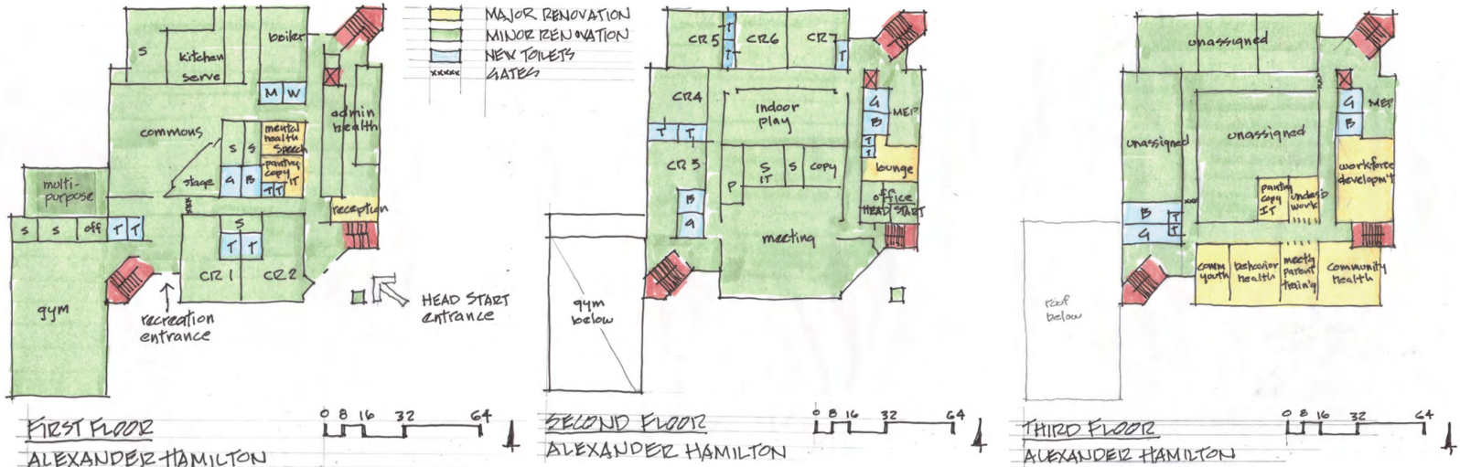
Initial plans for Alexander Hamilton proposed sites - as of 7/31/21

Over time, we envision this center as the start of something bigger – a place for intergenerational programming that upends the traditional approach to programs serving children and families, and that brings together our participants, volunteers and community to give every journey the support it needs.